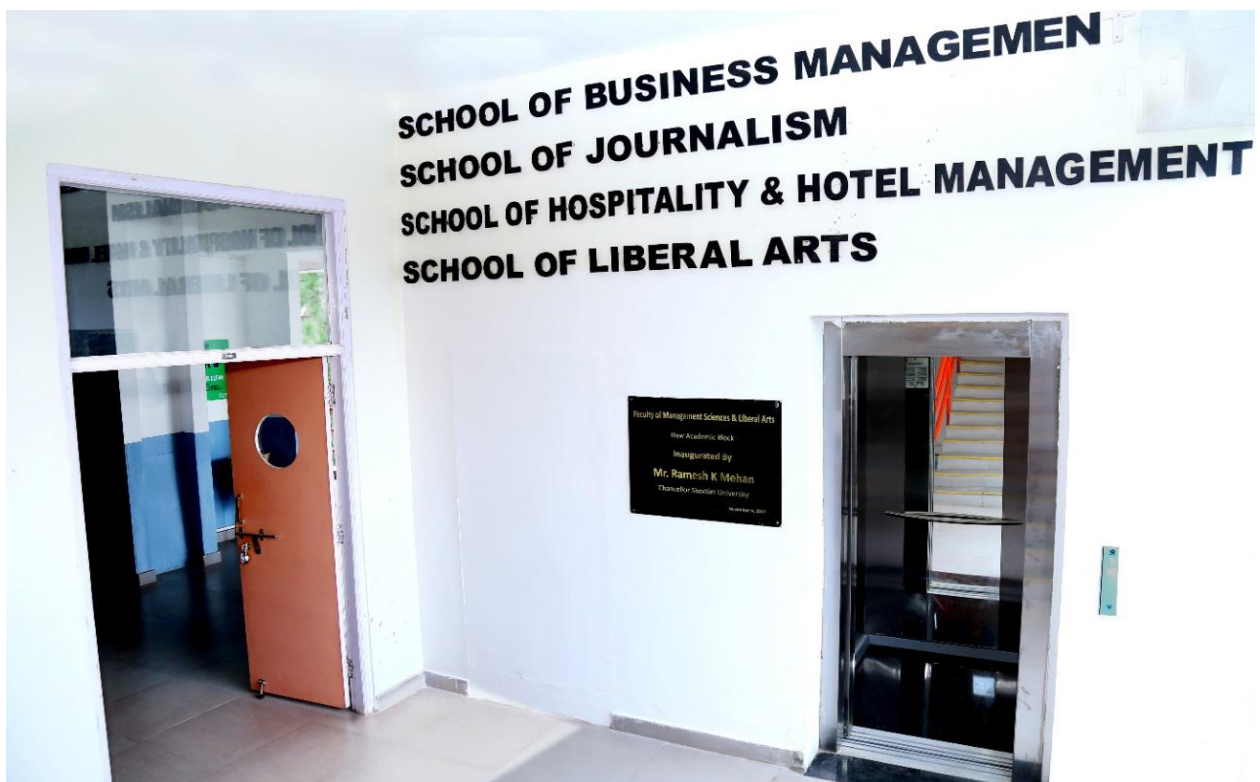
Lift in G Block