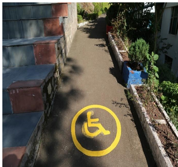
Ramps in Shoolini Campus