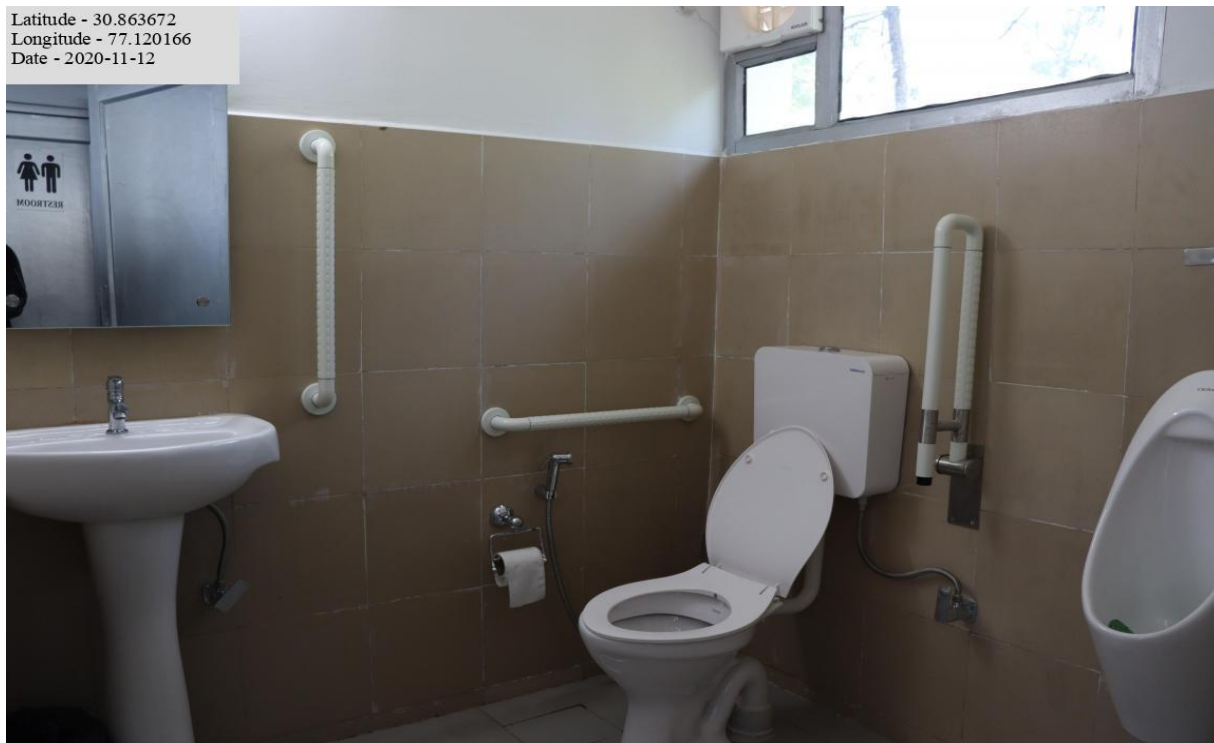
Special washrooms for differently abled

Latitude - 30.863672 Longitude - 77.120166 Date - 2020-11-12