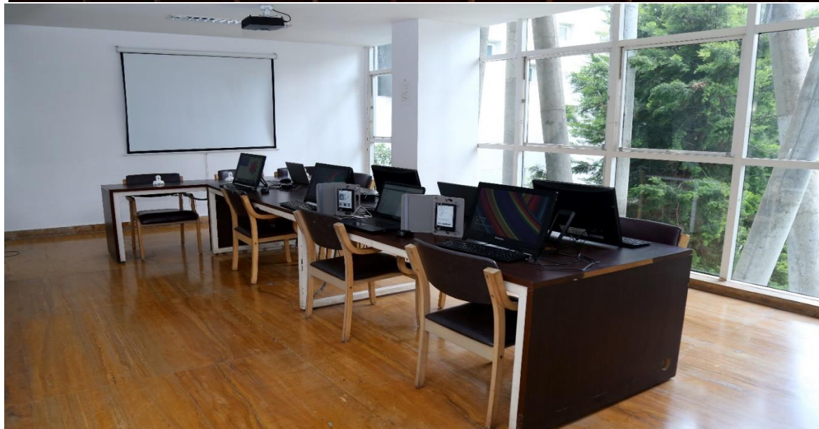
Amazon Kindles for Visual aid students