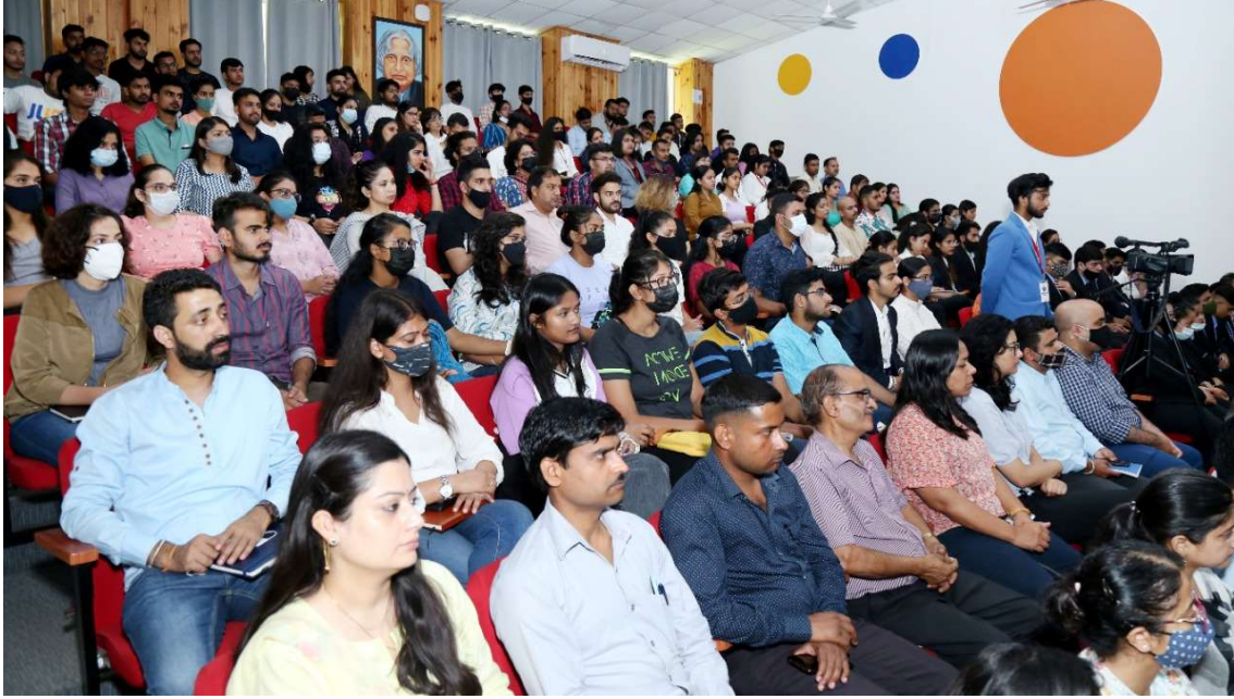
A photograph of the students at APJ Hall