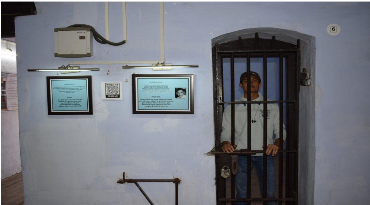
A view of Kothari in Gandhi Museum where prisoners were locked-up