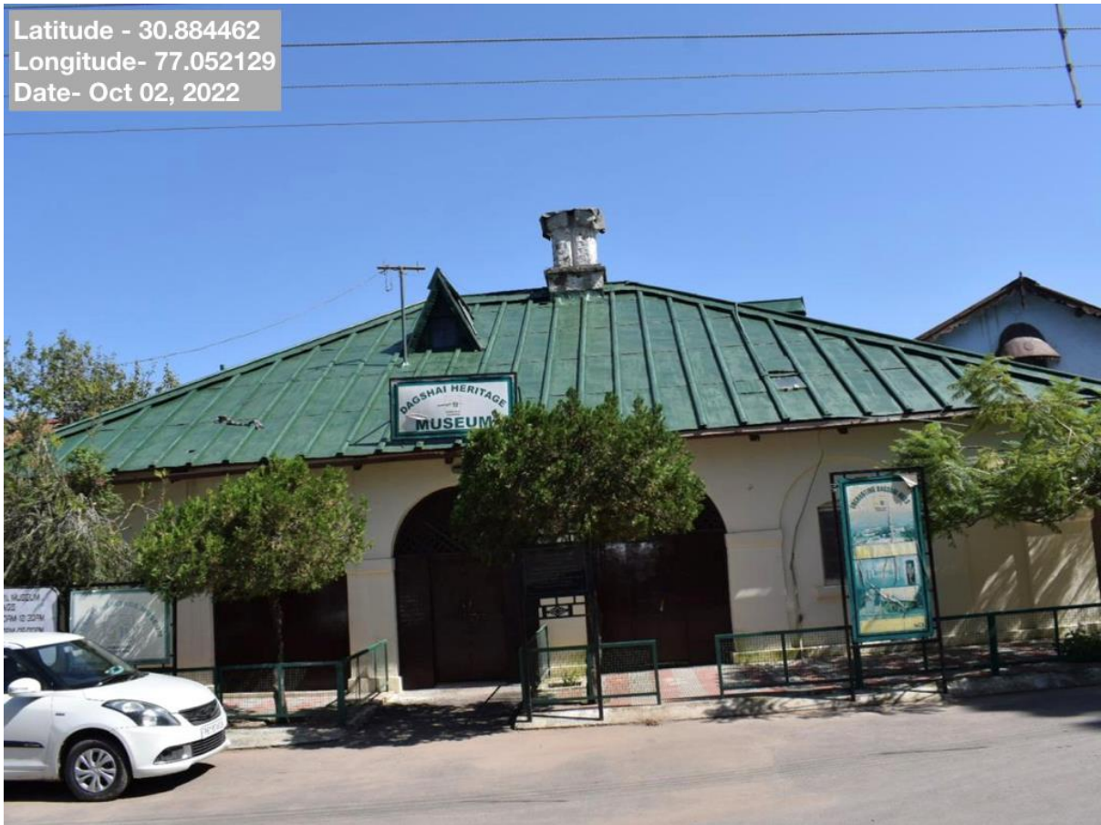
An outside view of Gandhi Museum at Dagshai

Latitude - 30.884462 Longitude- 77.052129 Date- Oct 02, 2022