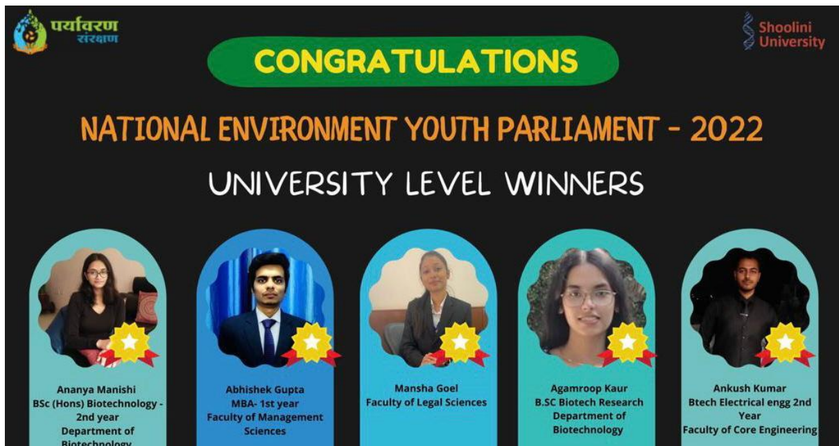
The list of winners of the competition