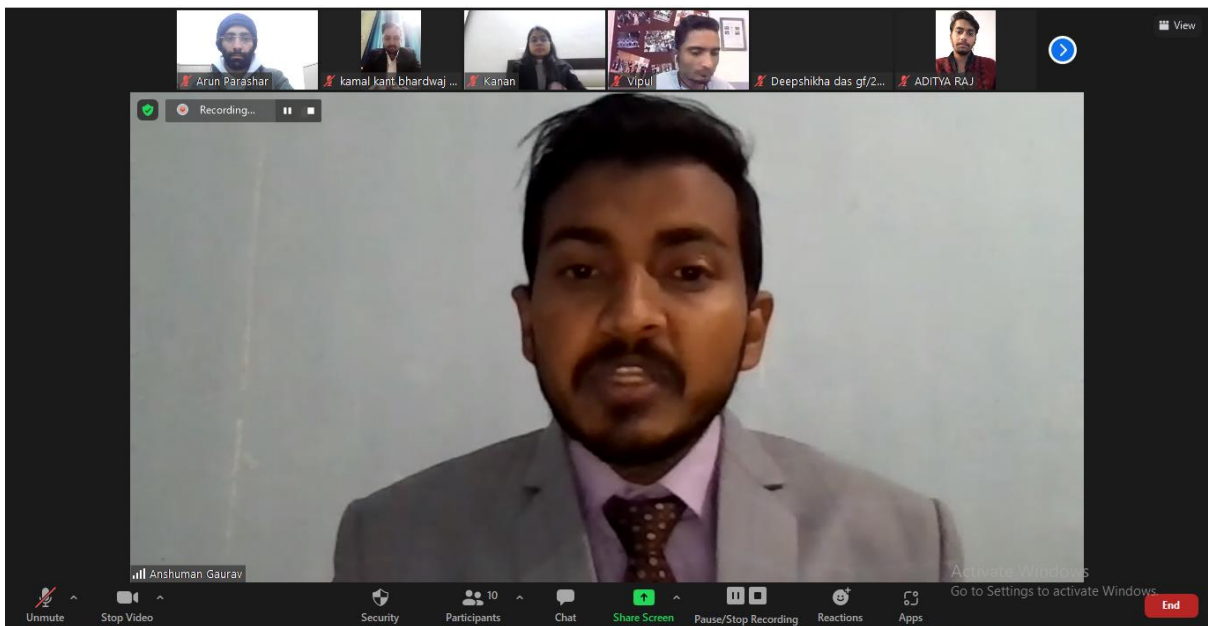
A student talking about sustainable development goals