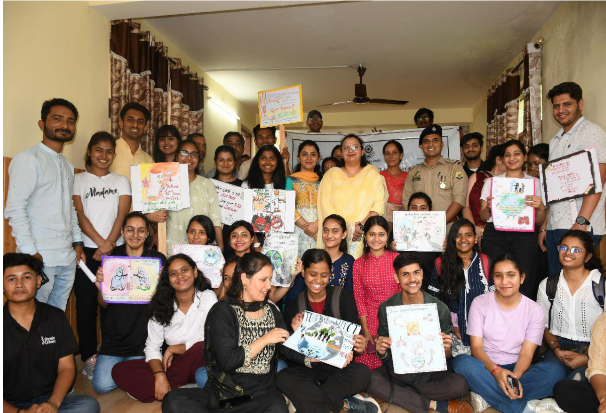
A photograph of guest speakers and attendees