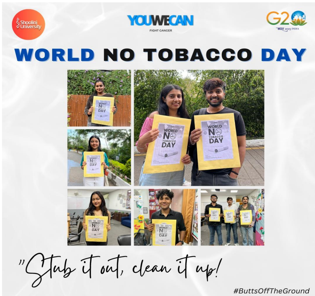
Poster with the volunteers with their envelopes