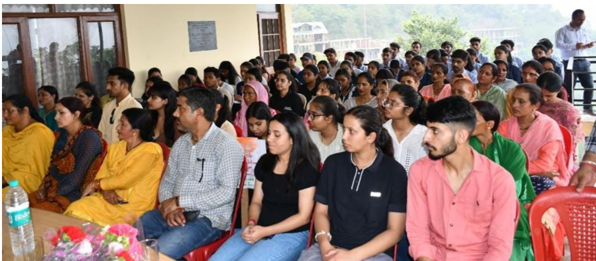
Students and villagers attending the awareness session